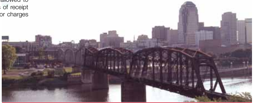
Downtown Shreveport across from the Red River in Bossier City

ART FORMAT AND GUIDELINES: Artwork must be CMYK and at least 300dpi. Artwork is reproduced at 85-line screen. Artwork provided on any magnetic medium must be formatted for Macintosh. Artwork that cannot be output due to incorrect