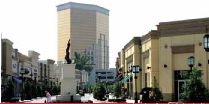
Louisiana Boardwalk, Bossier City

formats, missing data or on any media other than a CD-R/RW is not the responsibility of the publisher, and the publisher accepts no responsibility for unpublished materials. NOTE: Internet/web graphics (72dpi gifs, jpegs, etc.) are unacceptable for printing. QuarkXPress,™ Adobe In Design,™ Adobe Photoshop,™ Adobe Illustrator™ and Macromedia Freehand™ are the only acceptable programs for artwork and page layout. Color artwork should allow for a 20% dot gain.